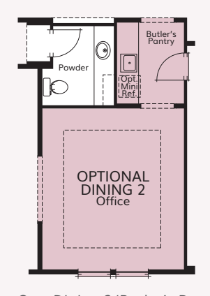
Opt. Dining 2/Butler's Pantry at Office & Drop Zone